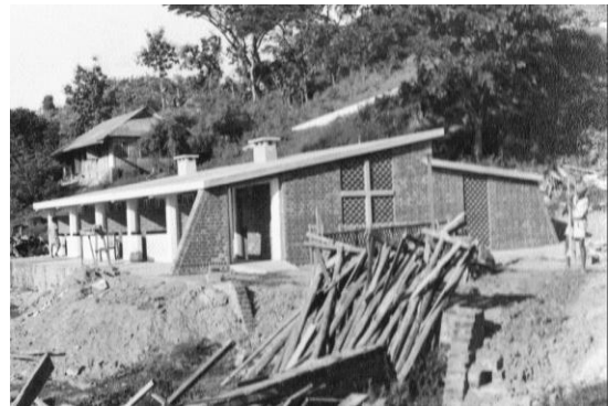
The Private Cabin Block opened 1966

The first major challenge was how to arrange the work so that the busy hospital could continue to function while the replacement of its buildings was going on. It was decided to clear a working space by building a new private cabin block, under the Female Nurses hill overlooking the football field, and then demolish the existing semi-pukka private cabins. The small amount of land the new hospital complex was to occupy meant the whole setup was very cramped, but the only other land available was the football field. I happened to casually mention this and the response was one of "pure horror" at the very idea, with much muttering of words like "sacrosanct".