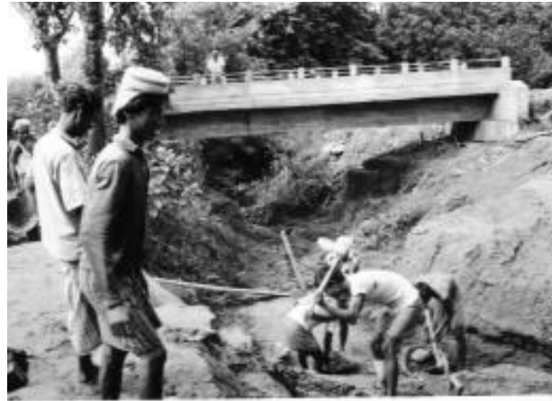
The road bridge built in 1969 - JNB is on the bridge and Pipeo Khyang, a labourer, in the foreground

Extending the road, which involved the use of bulldozers and belly dumpers hired from the Paper Mill, included replacing the wooden footbridge across the Tripura Sundari with a concrete road bridge to carry the brick paved road right up to the hospital. A new concrete roof on the original Arthington building and a new incoming electricity supply from the national grid with its own transformer were also completed. The enormous amount of rubble from the old Arthington building roof was used to extend the access road at its Lichu Baghan end, so that it now ran inside the boundary fence up to the Kaptai Road to a new entrance for both Hospitals.